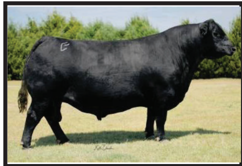
Born: 01/30/2017 Reg: 18837398