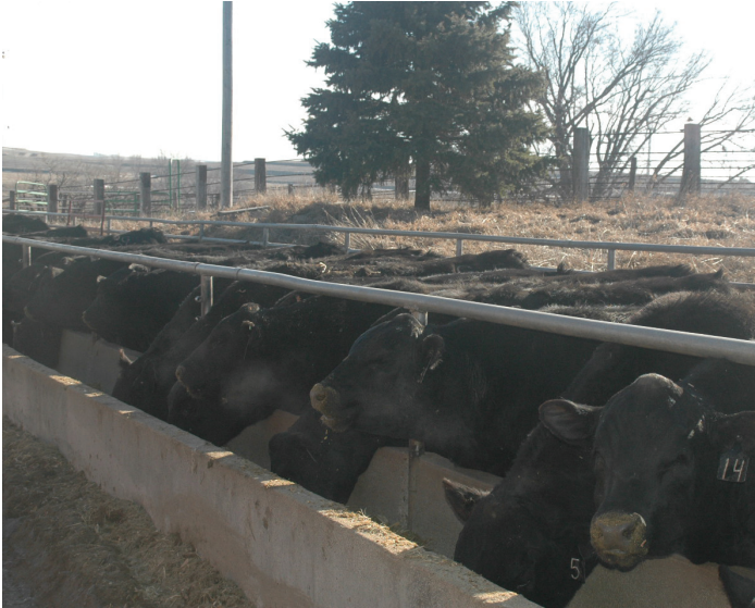
Check out the bull videos @ www.superiorlivestock.com