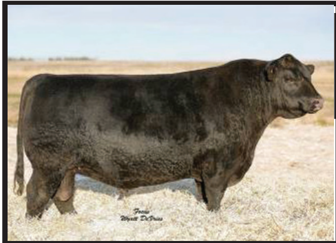
Born: 09/30/2016 Reg: 18814800